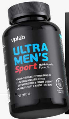
ULTRA MEN'S MULTIVITAMIN 180 CAPLETS