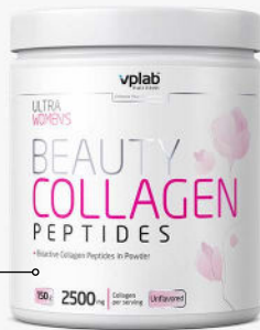
BEAUTY COLLAGEN PEPTIDES

From powerful multivitamins to collagen enriched products, the Ultra Women's range provides everything your body needs to look and feel its best.