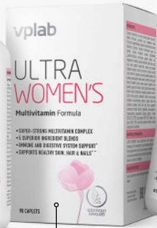
ULTRA WOMEN'S MULTIVITAMIN